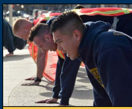
USNCG Sailors physically train at the National Mall.