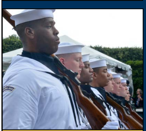
USNCG Sailors march in a parade