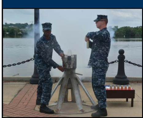
USNCG Sailors conduct a cannon shoot at the Navy Yard