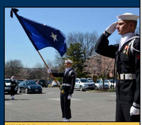
USNCG Sailors rehearse prior to a funeral.