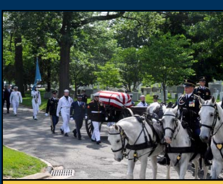
JSNCG Sailors conduct a funeral at Arlington National Cemetery.