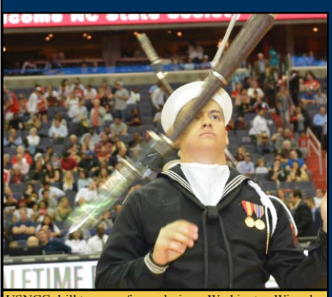
USNCG drill team performs during a Washington Wizards basketball game.